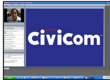
Presentation with webcam, attendee list and chat pod