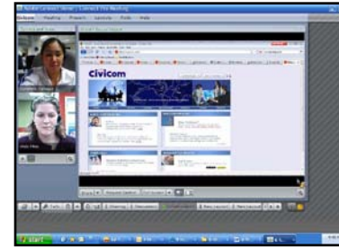
Two parties discuss a website